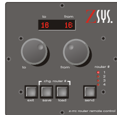
Up to four units can be controlled from optional z-rrc Router Remote Controller

The z-32.32r Digital Detangler Pro is a fully automated router, patchbay, and distribution amplifier for your digital audio signals. Just hook all your digital gear to the Digital Detangler - controlling "who speaks to whom" is as simple as the touch of a few buttons on the optional remote. You can send one source to multiple destinations, you can select between multiple sources to a single destination, or you can do anything in between. And once you've established a routing pattern, it can be saved and recalled later.